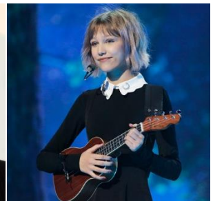
Grace Vanderwaal Assembly of First Nations, Queen's Jubilee Medal Recipient

Martin Sheen Co-founder of the Gord Downie-Chanie Weir Jack Fund. Emmy® and Golden Globe® Award-winning actor and activist